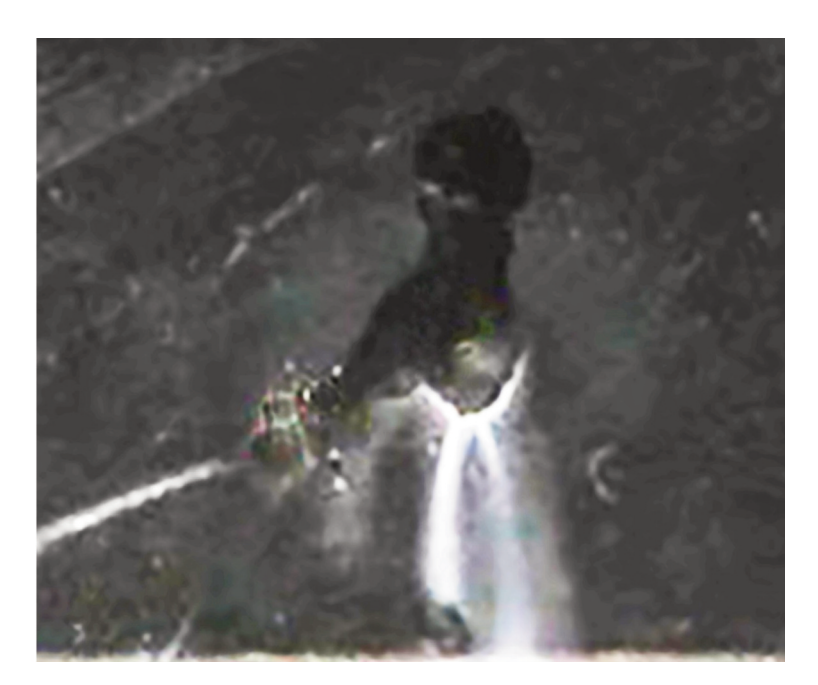
Figure 2: White powder residue remains after this particular epoxy formula broke down under electrostatic field stress and temperature cycling. The powder shows the path of the leakage current.

Health and environmental concerns mean that brominated flame retardants have been replaced by other materials such as aluminum trihydrate (ATH) compounds as additives to encapsulating materials to meet flammability requirements, such as UL's 94-V0. At temperatures of 220 degrees C and above, ATH breaks down and releases 35% of its weight as water vapor. When an arc occurs in a high voltage system, it can create plasma, with temperatures exceeding 2000 degrees C. However, I have seen materials break down at temperatures well below the published specifications under moderate electric field intensity. The release of water vapor by ATH is beneficial to mitigate flame propagation, but is particularly undesirable in high voltage insulating systems.